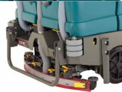
Dura-Track™ Parabolic Squeegee