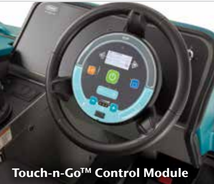
Touch-n-Go™ Control Module