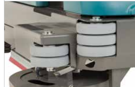
Heavy-duty Frame and Cushioned Corner Rollers

Overhead guard protects operators from falling objects.